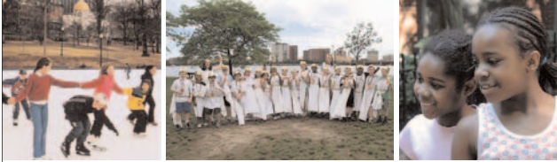
RIGHT: STUDENTS DURING RECESS ON ADVENT'S BACKYARD PLAYGROUND.