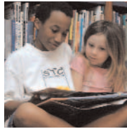
RIGHT: FOURTH GRADER RESEARCHING INSECTS AT THE HARVARD PEABODY MUSEUM.