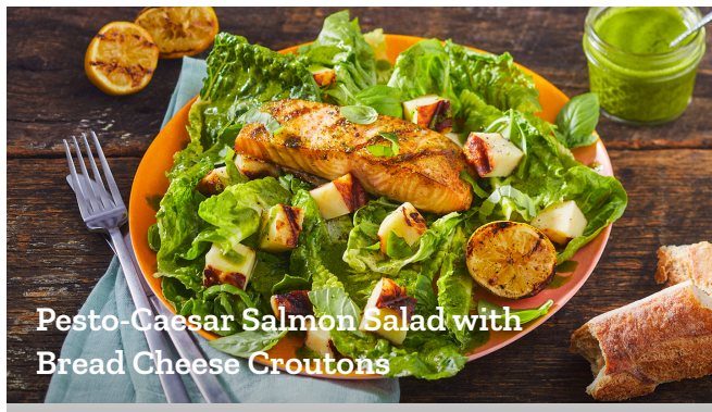
Pesto-Caesar Salmon Salad with Bread Cheese Croutons