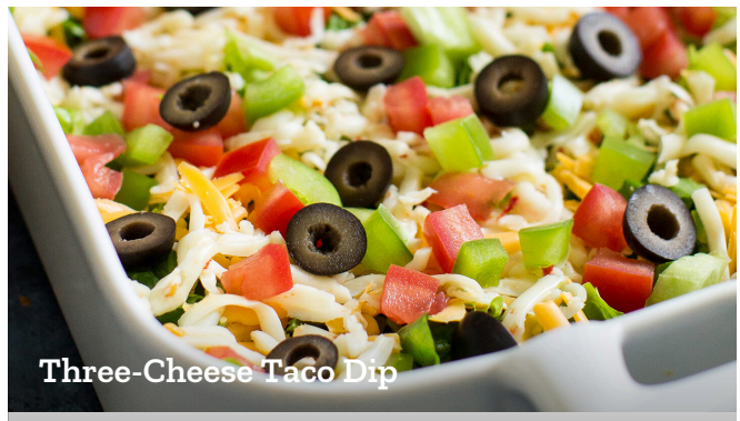
Three-Cheese Taco Dip