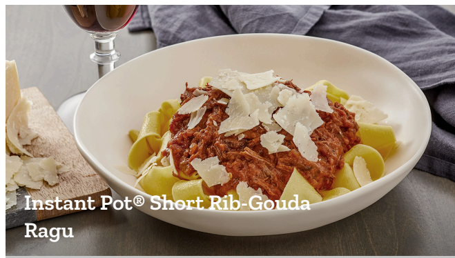
Instant Pot® Short Rib-Gouda Ragu