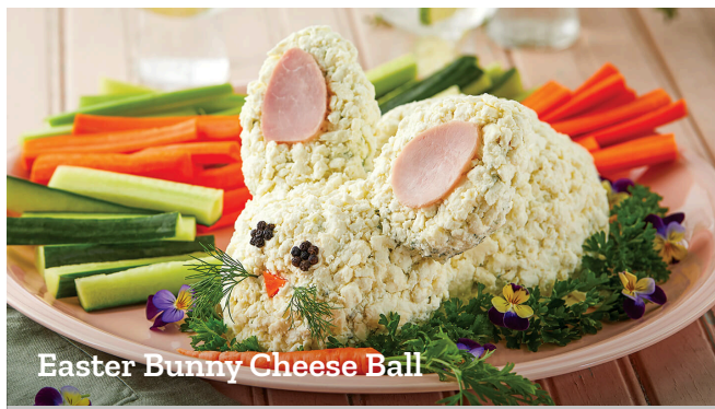
Easter Bunny Cheese Ball