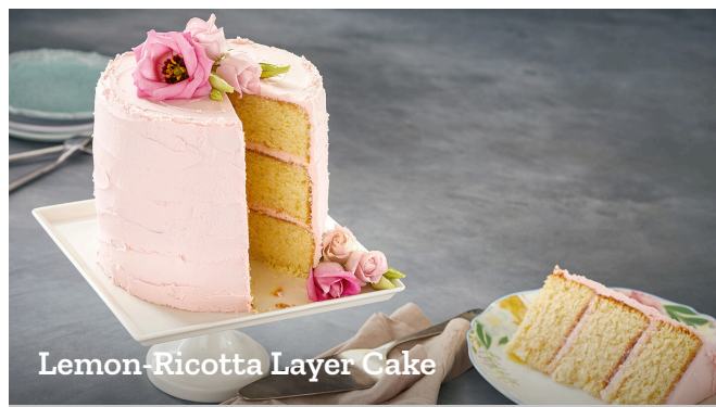
Lemon-Ricotta Layer Cake