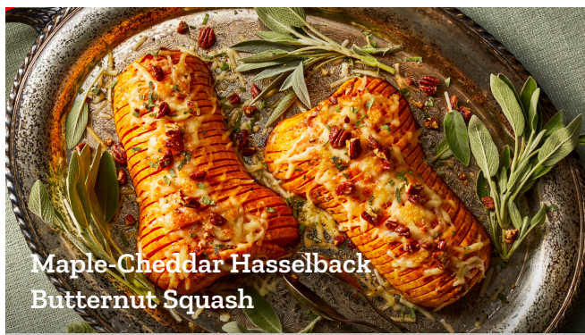
Maple-Cheddar Hasselback Butternut Squash